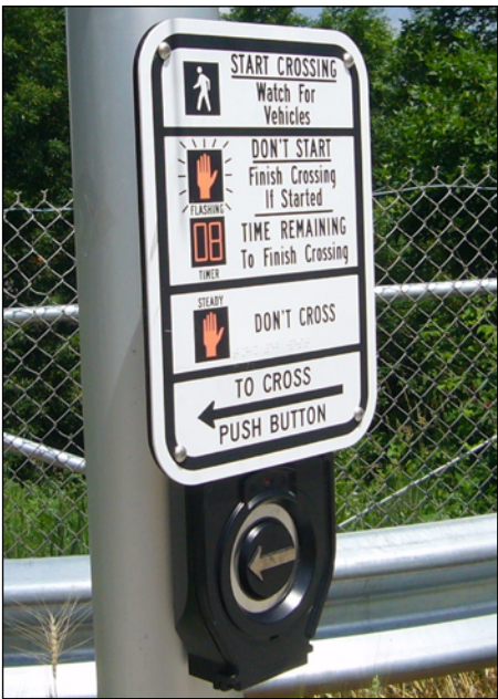
Figure B-1: Accessible Pedestrian Signal

The county implements APS to current standards with applicable projects. This is generally completed with the installation of new or modified traffic signal systems, when the modification includes below-grade work requiring excavation and at intersections including pedestrian elements (countdown timers, crosswalks, pedestrian indicators, pedestrian ramps, sidewalk/trail, etc.). Several factors may increase the timing to install APS, including customized equipment, product delivery, upgrades to signal controller hardware, installation of electrical conduits and pedestrian ramp construction.